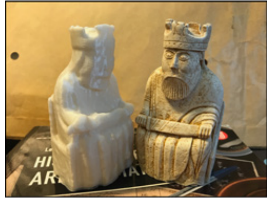
Figure 1: Lewis Chessmen, copy and original

A basic approach to many 3D printer projects is making – the act of doing as a way of learning (Gauntlett, 2013). 3D printers are often placed in so-called makerspaces, workshops that combine technological infrastructure with openness and knowledge transfer between users. The makerspace idea has been primarily oriented towards the STEM tradition, in other words natural sciences and engineering, but we can see how “critical making” has gained traction within the humanities in recent years (Ratto, 2011). Many humanities scholars point to material creation processes as a way to think (Ingold, 2013; Bogost, 2012), and they we are definitely in the domain of the humanities. Makerspaces also have a political subtext, given that it is often framed as taking control over the production mechanisms of the future.