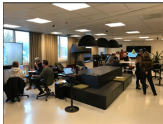
Figure 2: Students rotating between stations in DDV

Through these different representations of the same “original” cultural heritage object, we discussed themes such as materiality, authenticity, “aura”, and digitization. Following this exploration, the students spent the next two weeks developing their own 3D printing project, in groups. Here, they were to locate a digitized cultural heritage object model and print it, with support from the DDV student assistants. The students developed skills with using 3D printers, learning to find digital models and prepare them for printing. The project enabled students to use the digitized collections of GLAM institutions.